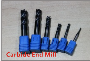
Carbide End Mill