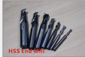
HSS End Mill