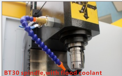
BT30 spindle, with flood coolant