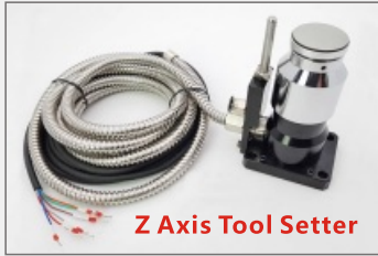
Z Axis Tool Setter