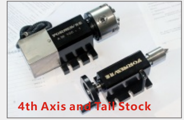
4th Axis and Tail Stock