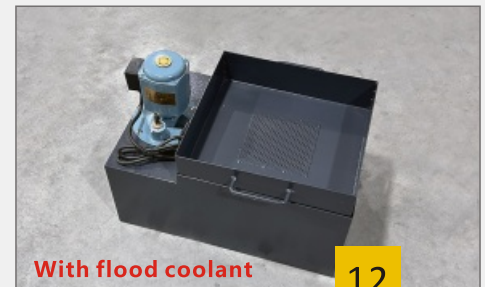
With flood coolant